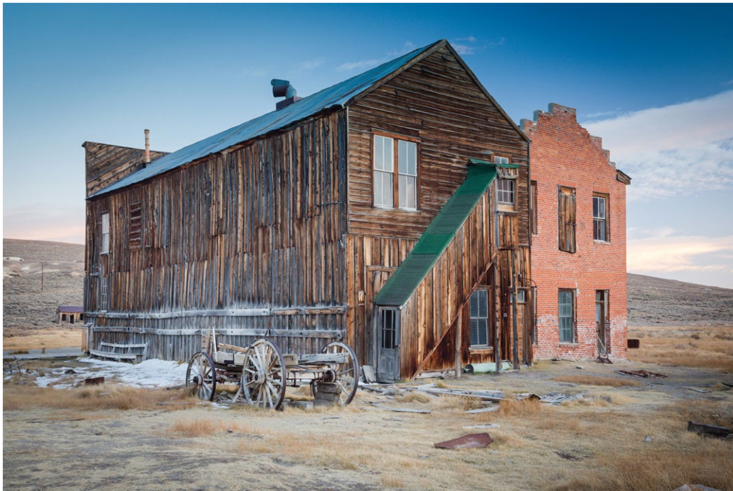
Bodie State Historic Park

Professional photographers wishing to use park settings for publication for either film or still photographs must obtain a permit from the California Film Commission at www.film.ca.gov .