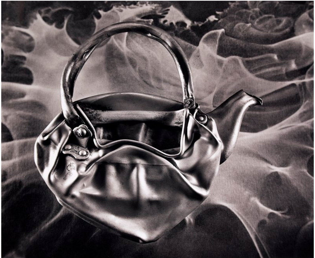
Ruth Bernhard: Teapot [road kill]

Ruth found this teapot in the middle of a road after it was run over by various vehicles. Noting the photographic possibilities, Ruth relocated the teapot into her studio to be photographed on top of a decorative fabric.