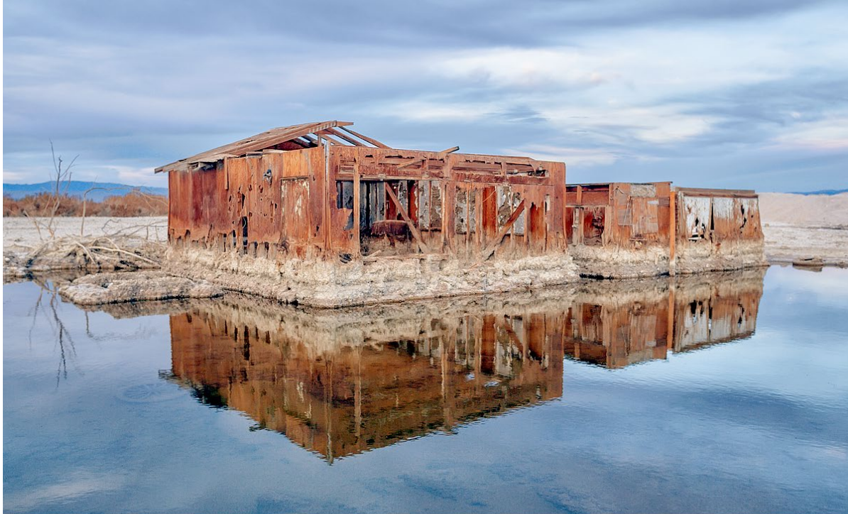
Abandoned houses, Salton Sea, California